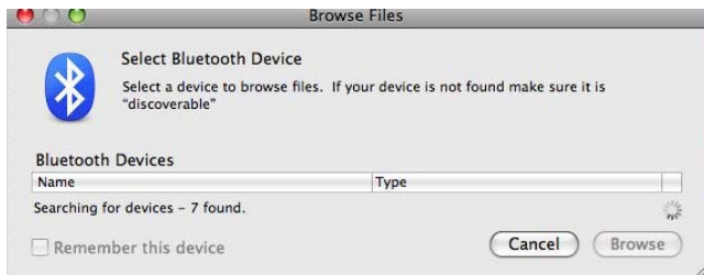
Figure 1. Scanning for participating Bluetooth phones. The list of devices is hidden to protect participants' details.

In our initial trial with these participants, we were able to gather some responses to different questions. We used a MacBook with Bluetooth capability as the base station. Figure 1 shows the Bluetooth scanning in response to a question.