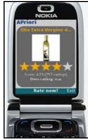
Figure 3: Screenshot of an overall rating for olive oil in APriori

The user interface implementation was a challenge. We designed a simple user interface (see Figure 3), making use of the well-known 5-stars visualization of ratings. In the future, users will be allowed to switch between an overall rating view of a product and a detailed rating view with the adaptive rating criteria using the direction keys of their phone.