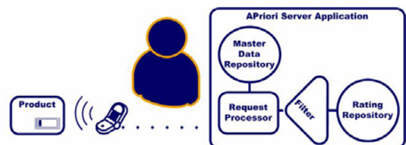
Figure 1: Building blocks of APriori

A coarse overview of the building blocks of APriori is given in Figure 1. Users access APriori through an application on a mobile phone. In order to receive product ratings or actively rate products, users scan tags which are attached to products already today. This can be any tag which is capable of storing an identifier on product type level and which can be read by mobile phones. Natural candidates are barcodes and RFID tags of all types.