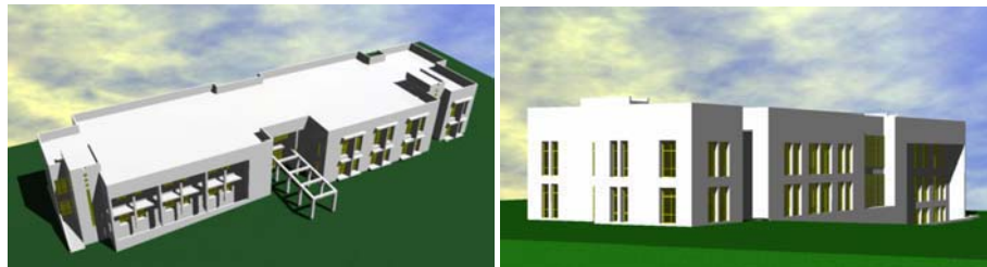
Fig. 1. Digital maquette of ICS-FORTH’ AmI Facility (currently under construction).

The above components are to comprise a generic set of “building blocks” that will be employed to synthesize a wide range of AmI applications. Furthermore, the interaction of such different AmI components will be studied in depth. The first results of this effort are expected to be delivered by the end of summer 2008, in the form of an integrated AmI Sandbox demonstrator. These results, depending on their utility and impact, will be “propagated” to the ICS-FORTH Ambient Intelligence Facility (see Fig. 1), that is currently being built and that will occupy a three-floor 3,000 square meters building, comprising simulated AmI-augmented environments and their support spaces (e.g., computer and observation rooms), laboratory spaces for developing and testing related technologies, staff offices and public spaces.